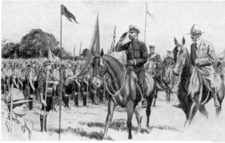
THE KING ARRIVED UPON THE SCENE

The secret of its growth, as I have said, lay in that indeterminate force which we only know as the 'Scout spirit'.