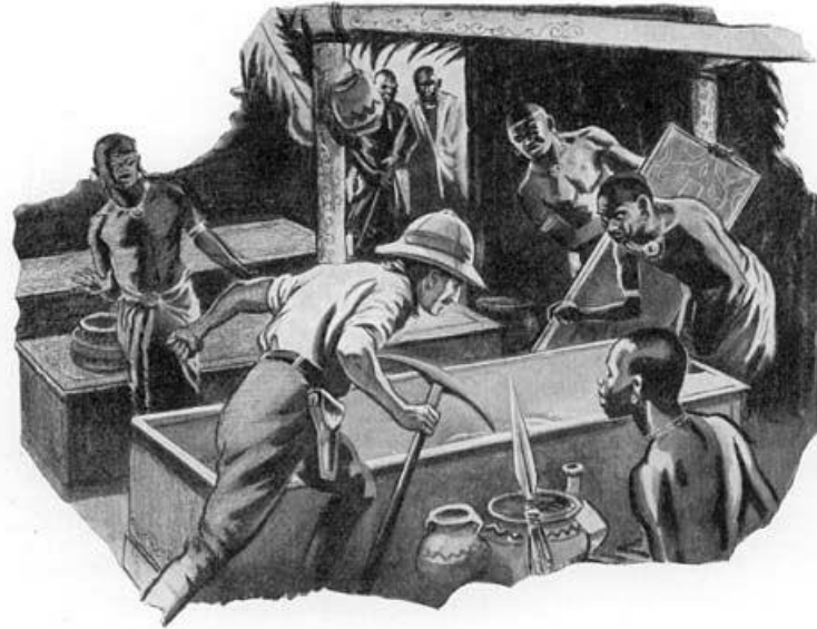
NOTHING BUT EMPTINESS WITHIN

Their humour was one of their great assets. Horrible-looking fellows they were, their heads shaggy with long ringlets where otherwise ordinary men had shaven scalps. And, worst of all, they each wore a life-like reproduction of a third eye in the centre of the forehead.