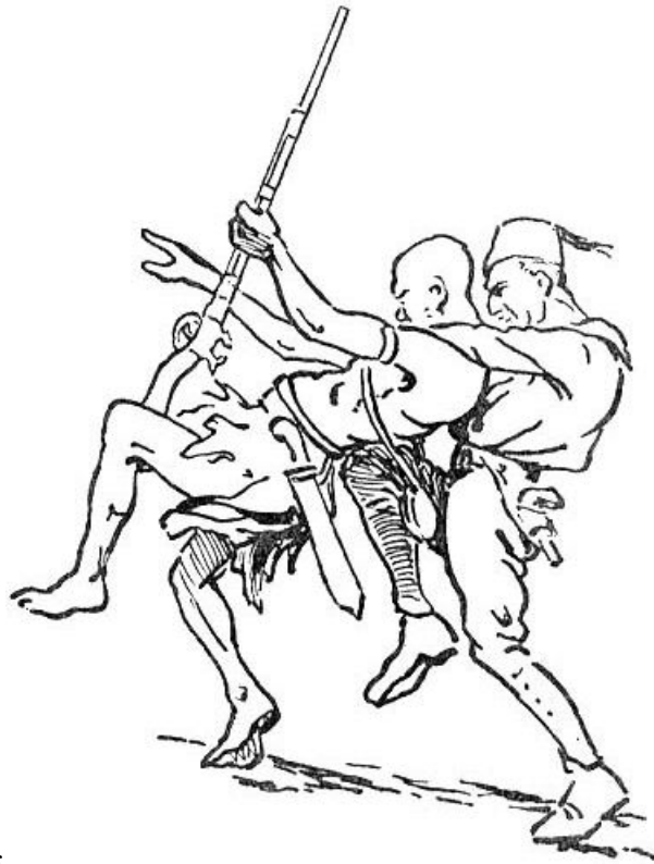
CAPTURE OF THE KING'S SCOUT

No argument was necessary. The dead bodies lying in the sacred grove yonder were evidence enough.