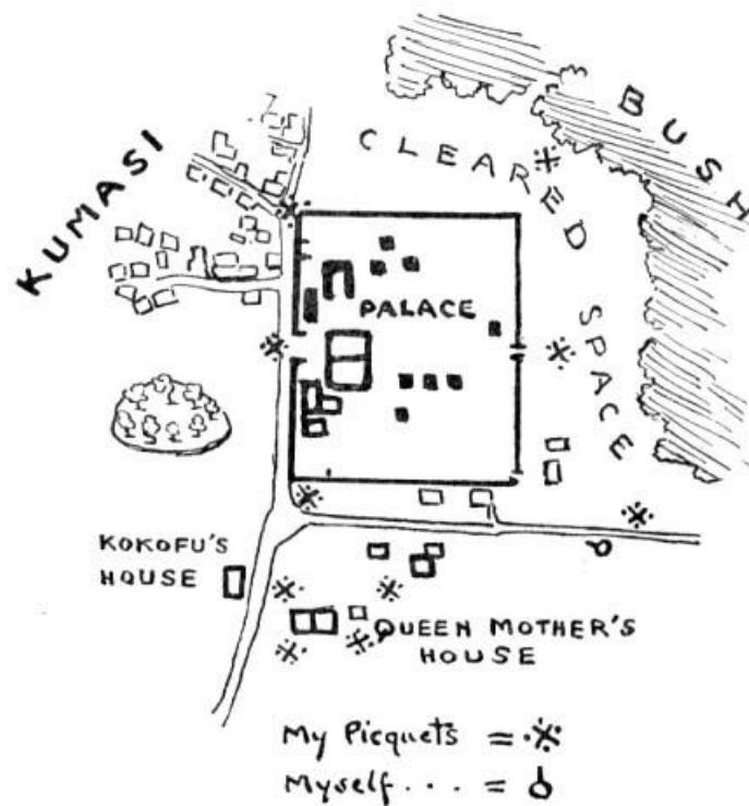
PLAN OF PREMPEH'S PALACE AND NATIVE LEVY GUARDING IT AFTER CUTTING AWAY THE BUSH

The King and the Queen Mother were told to come forward and do obeisance to the Governor of the Gold Coast, as representative of the Great White Queen.