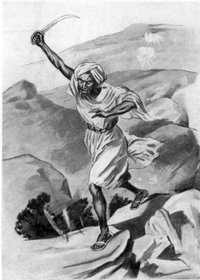
IT WAS A SPLENDID SIGHT TO SEE HIS RUSH

While the artillery were in the midst of pounding the sungurs we noticed three men, in one sun-gur , armed only with swords, and who disdained to take cover when the shots came near them, but coolly stood up, waving their curved glittering blades, and evidently encouraging their fellow-tribesmen to make a counter-attack on the British troops, who were now clambering up the face of the position.