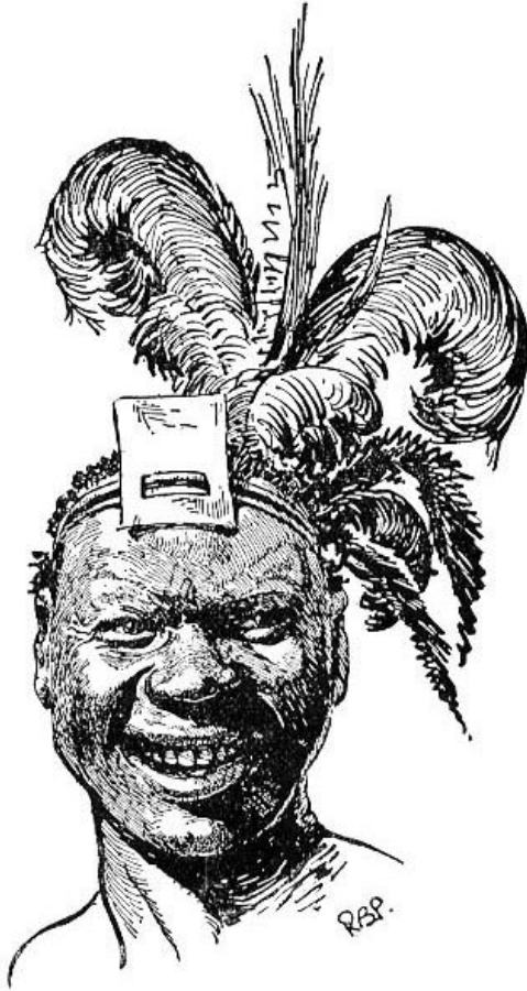
JOKILOBOVU WAS GRINNING

‘Well, and we believed what the missionaries told us; so when white men asked if they could come and set up their shops in our country we, the rulers of the nation, welcomed them, knowing that they would show our people how the white man carries out these good precepts in his actual practice of daily life.