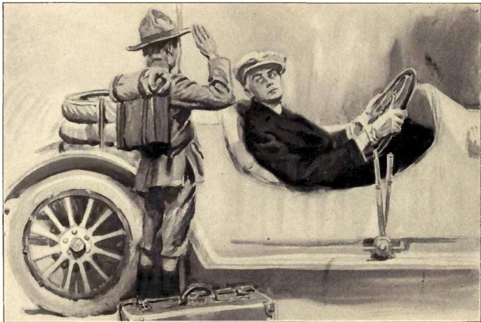
Jimmic dropped the valise, forced his cramped fingers into straight lines, and saluted. [Page 10]