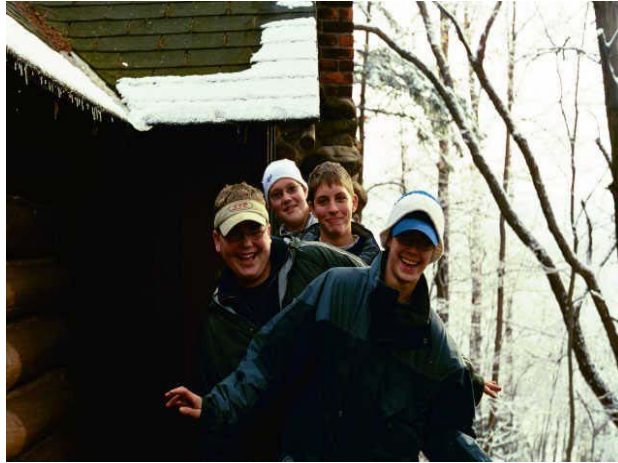
Scout Camp - One of our favorite sites!!!

Example: Inspirational stories, scouting