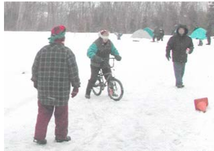
This WILL eventually become a snowman, honest !