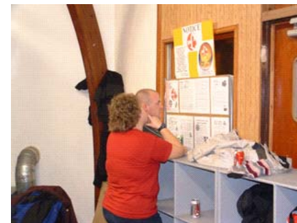
More shots of the fun during Friday's mixer activities.