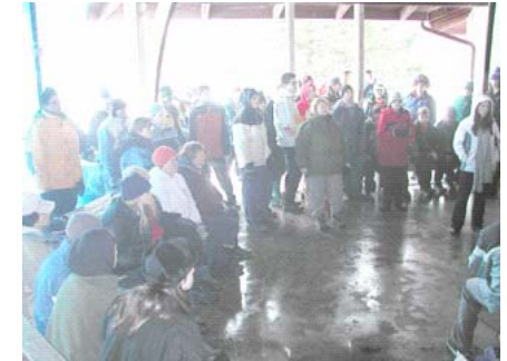
Now remember, if you can't find where the activities are, ask any staff member — they'll be happy to get you lost....er, on the right track.