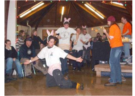
Friday night's mixer games begin. Heh, heh, heh!!!!