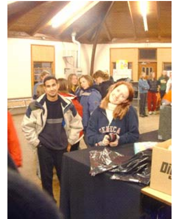
So, where's the action?