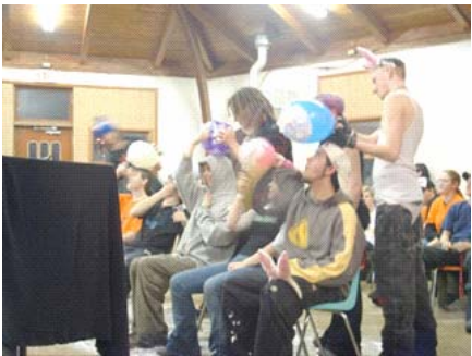
We'll shave these balloons as smooth as a baby's behind.