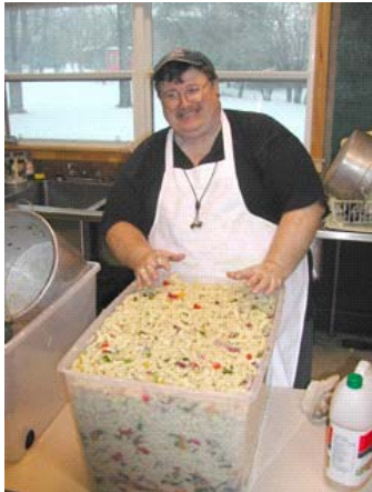
Prepping the food for Saturday's pig roast.