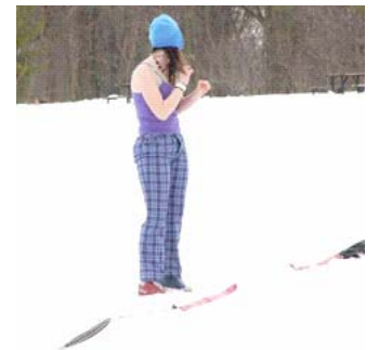
OK, OK. I know it's cold out here, but they said everybody has to take their clothes off so we can tie everything into a long string — THAT'S what the stupid rules say.