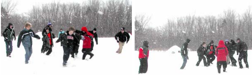
Trash Ball at it's very finest.