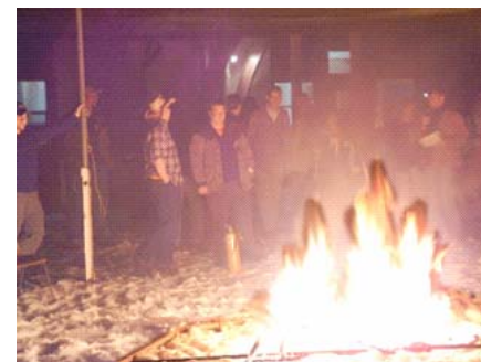
When the Olympic Rings burned down, there was still a nice afterglow.