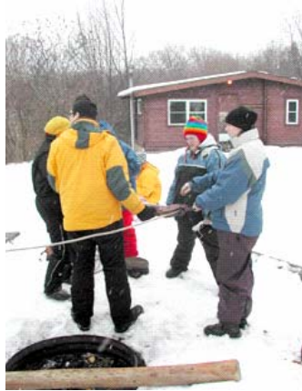
In Scouts they call this game the Nuclear Reactor.