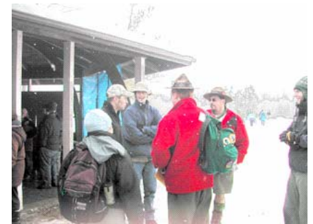
Any last minute questions? OK, get out there and have fun.