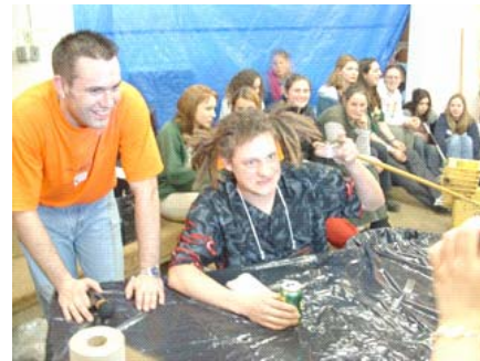
I'm not sure WHAT this game is, but I get to stuff my face.