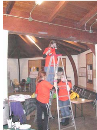
Some of the staff preparing the main lodge for action.