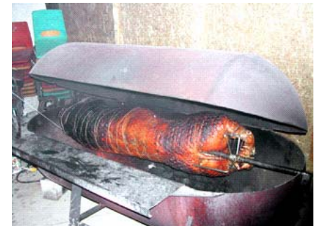
OK, it's going to take 20 hours to roast this pig for Saturday's supper. Let's get at it!