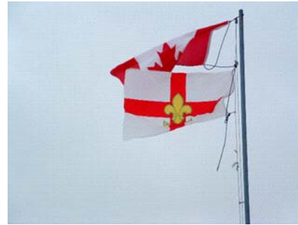
Saturday morning—the games begin.