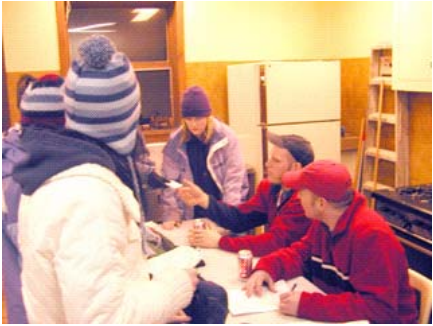
Checking out the scavenger hunt returns.