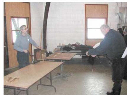
Using the rope machines to make lanyards.