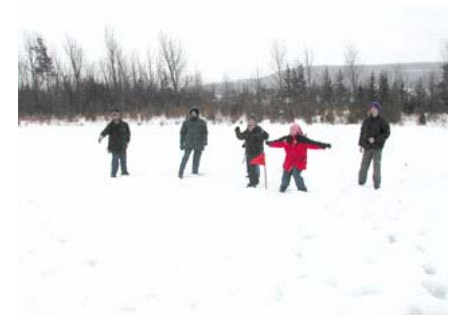
The only event that required MORE skill than Possum Tossing was Toilet Seat Horseshoes — as shown here.