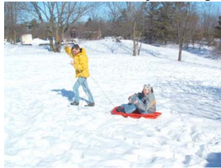
Hitching a ride to the parking lot.....OOPS!