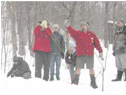
Sling Shot Archery