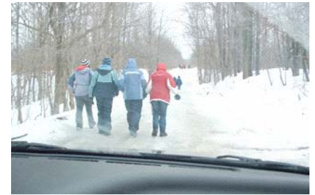
On the road to the Polar Bear Dip