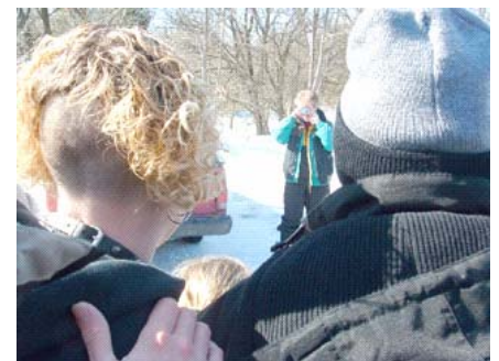
A picture of the picture taker.