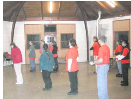
As the afternoon activities were winding down, SOME people practiced their line dancing.