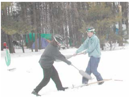
They lost their horses, but it's still "Jousting".