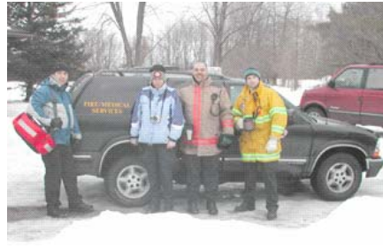
The great First Aid Crew