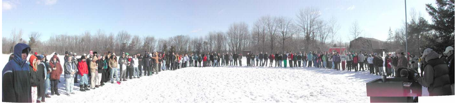
Sunday morning — Closing Ceremonies