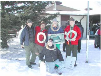
1st place — Dan Beard Crew