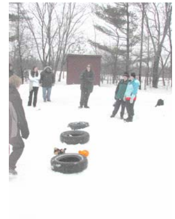
This event, which required great skill and concentration, was called Possum Tossing.