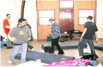
Full Contact Musical Crates (we ran out of chairs)