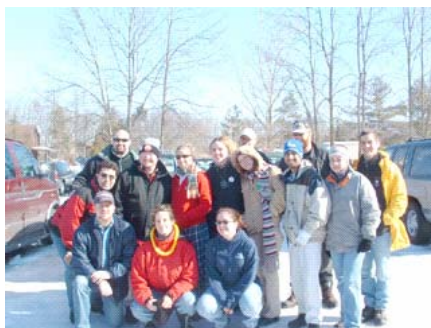
Until we meet again. When's the next Moot????