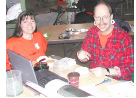
Cutting CD's for the masses.