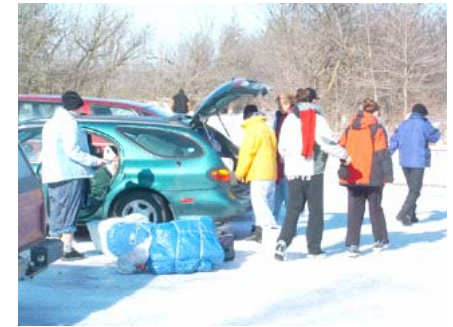
All this fit in here when we came???