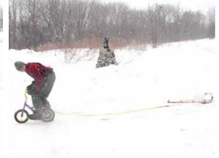
The Tractor Pull