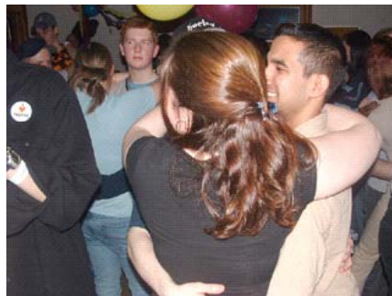
Saturday night's dance had a lot of movin' and shakin' going on.