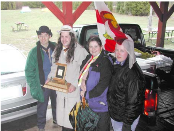
Members of the UWRC offer congratulations