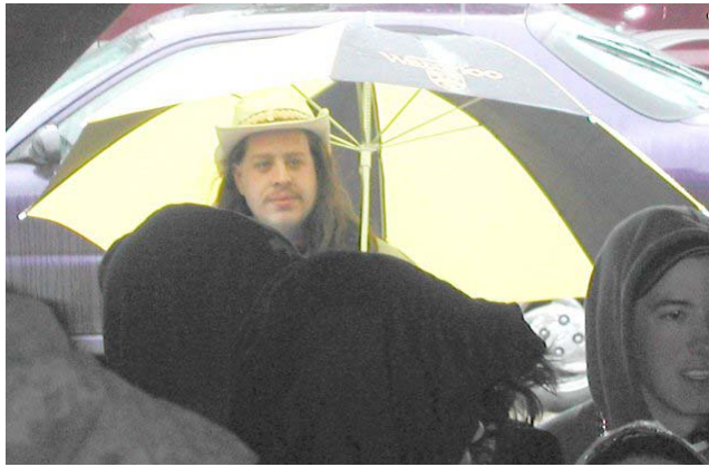
A face in the crowd—before the presentation