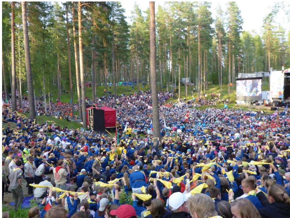
12,000 youth at Roihu 2016 mid-point ceremony, 7 th International Finnjamboree