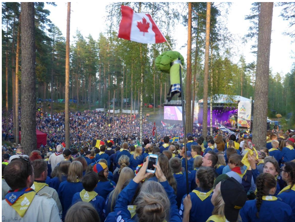
17,000 youth at Closing Ceremony at Roihu 2016, 7 th International Finnjamboree