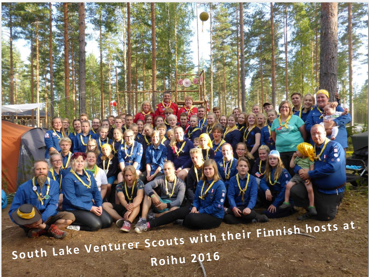
South Lake Venturer Scouts with their Finnish hosts at Roihu 2016