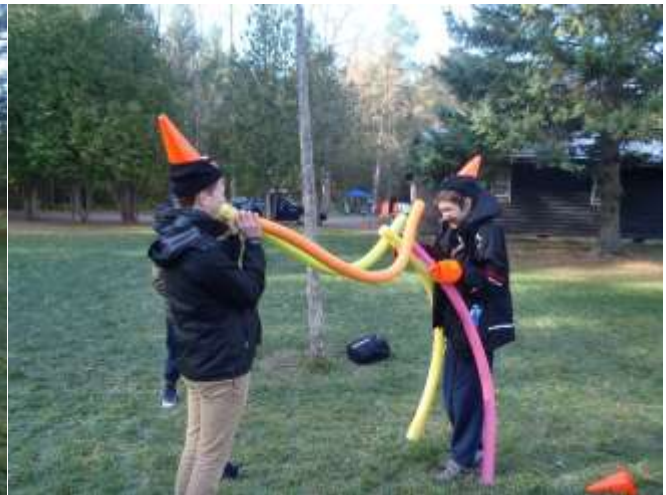
Pool Noodle Fighting at Zoo Moot – Episode 8: WEEVIL