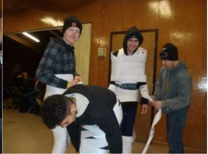
Cocooning at Zoo Moot – Episode 8: WEEVEL