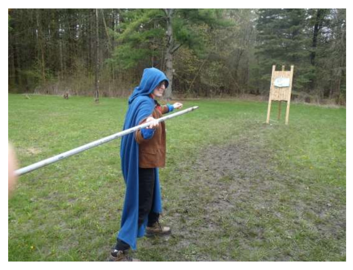
Javelin at Camelot Moot 2017