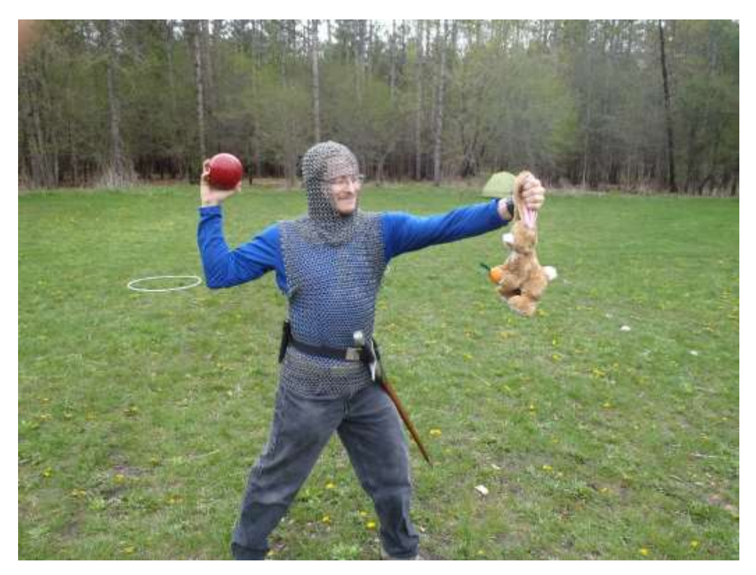
Holy Hand Grenade at Camelot 2017, "1, 2, 4, I mean 3!"