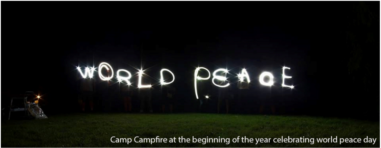
Camp Campfire at the beginning of the year celebrating world peace day