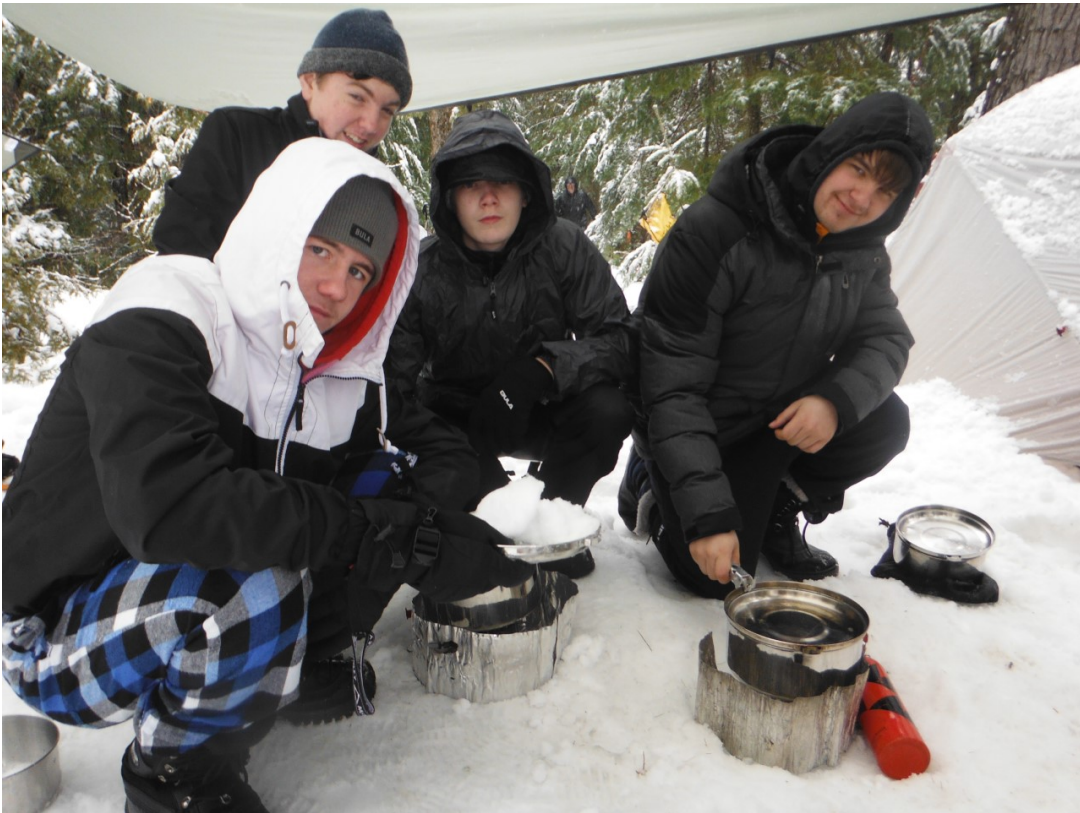
12 th Whitby Venturer Scouts