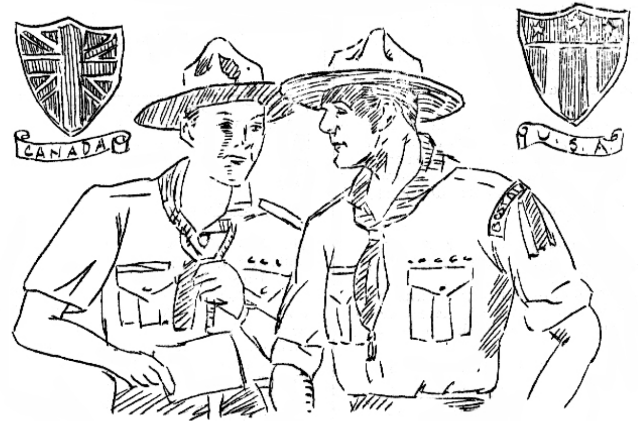
REPORT ON THE THIRD NEW ENGLAND ROVER SCOUT MOOT Held at Camp Squanto, Near Plymouth, Mass.

A blast on the Kudu horn announced the official opening of this the third Moot of the New England Rover Scouts. The weather at the start was inauspicious, but soon gave place to glorious sunshine.