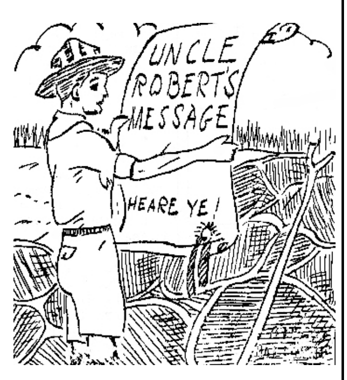
Dear Brother Scouts -

As you have noted on the previous pages, steps are being taken towards the formation of a Rover Scout Association, and I understand that this association will undertake to exercise no legislative or administrative functions, but will be only for social purposes and exchange of information among its members.