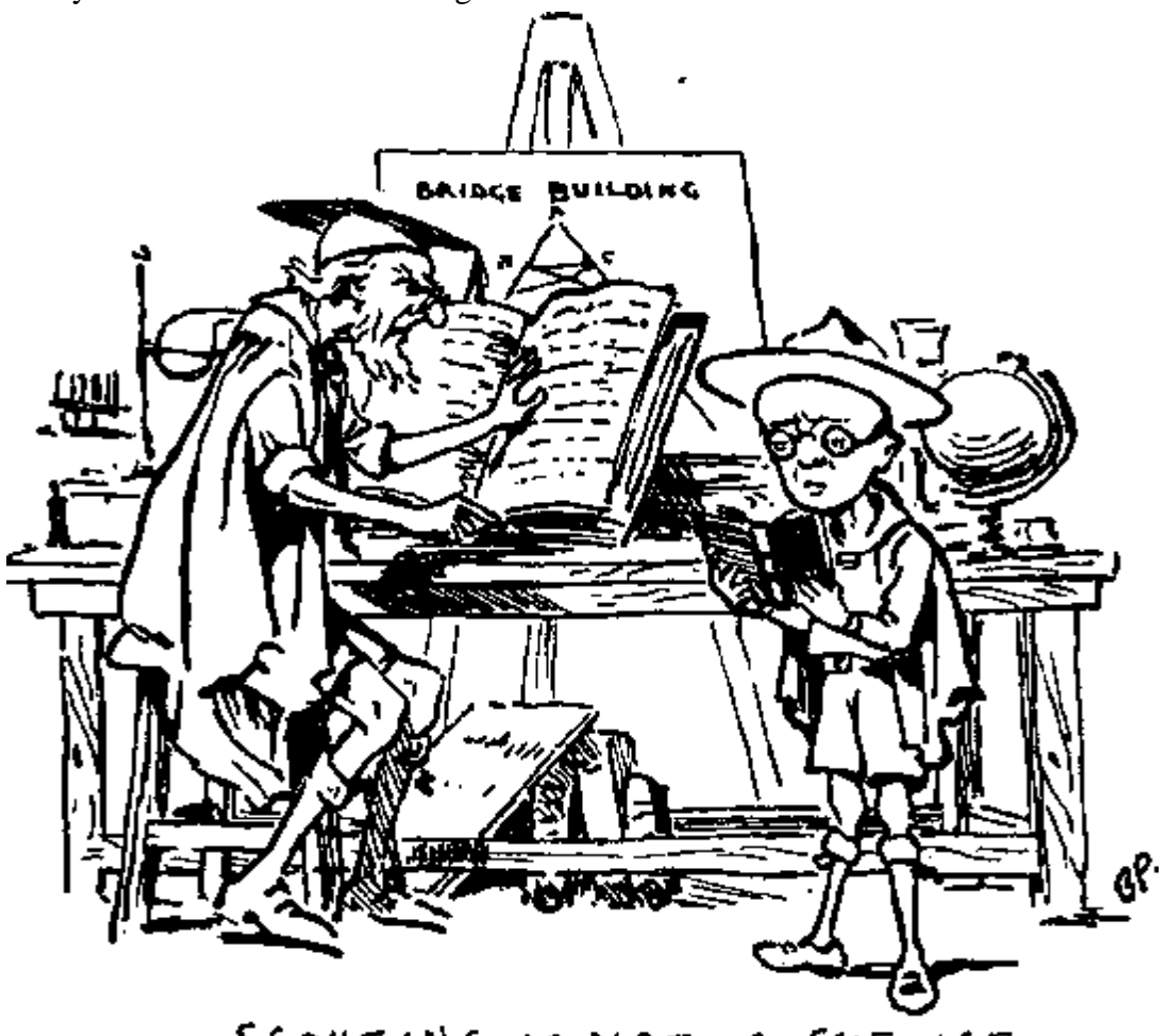
SCONTING IS NOT A SCIENCE

It becomes like the game of polo which was suggested to me by a General under whom I served. A melancholy occasion had arisen when the Troops in the garrison were ordered to go into mourning. This happened on the very day that an important polo match was to be played. So I was sent as a deputation to the General to ask whether the match would have to be cancelled. The General, with a twinkle in his eye, replied: "I think if you played very slowly and used a black ball it might meet the occasion."