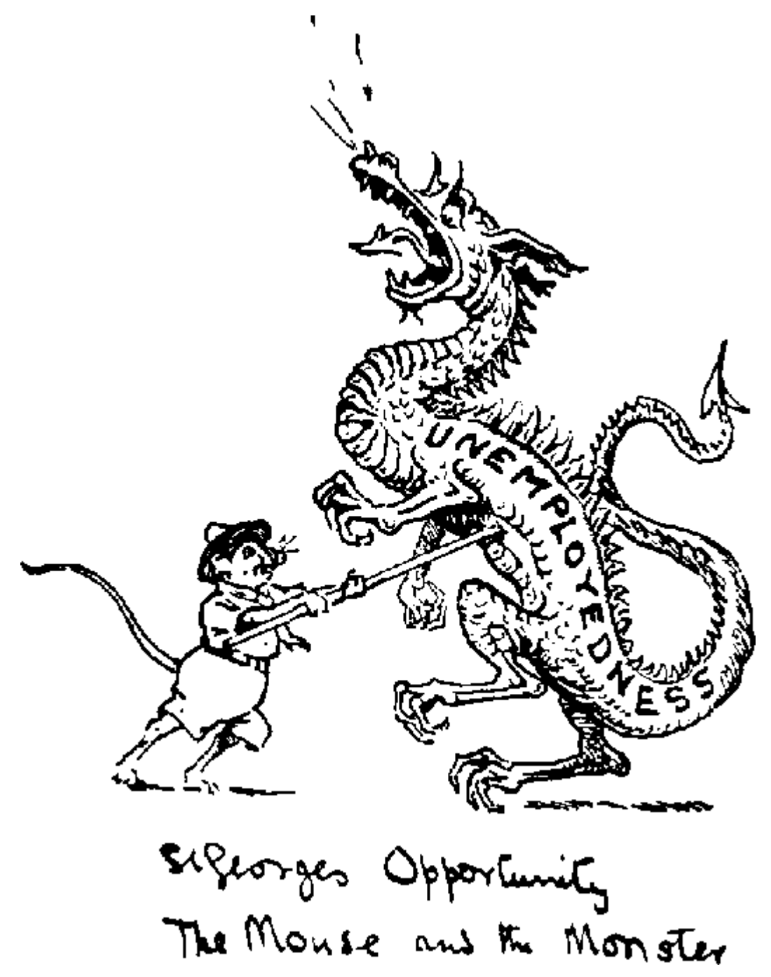
The present depression in industry should, we may hope, pass away before long, but the ill-effects of unemployedness will be lifelong on its victims-- they have before them, as

Fortified by these I am now able to shout, "Now where's that damned dragon?" I don't really see any very formidable one in sight, though in my elated condition I might be excused for seeing two. But, such as I do see, the one to be attacked is the unemployedness among the youth of the nation. If we in the Scouts can do something, however small, towards overcoming this awful canker in our midst, we shall be doing a genuine national and Christian service.