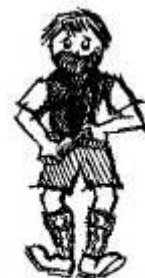
Squeeze the ends together to keep the jam in.