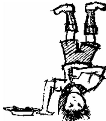
Changing feeding habits.

If the carcass has been rather thoroughly picked, you'd better add a packet of chicken soup to the above at this stage and cook it for about 15 minutes.