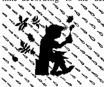
In the cool of the evening.

Some Scouts in camp eat their main meal in the middle of the day, others in the cool of the evening. It's possibly best to vary the time according to the demands of the rest of your day's programme.