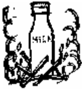
Warm a pint of milk.

Yob Fruit Salad. Muster as great a variety as possible of fresh and tinned fruit – including several pounds of apples. Peel and slice apples into a large billy, until there is a layer a couple of inches deep. Sprinkle on sugar and then a layer of one of the other fruits, e.g. plums, blackberries, pears, grapefruit, cherries. Then another layer of apples . . . continue this routine until the billy is full. Cover with plate and apply pressure. Increase the pressure gradually – allowing 24 hours for the whole process. Delicious . . . serve with ice-cream.