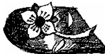
Rose on toast.

Again not less than three courses (my old Scouts loved to show off on special days by producing wonderful six course dinners, and marvellous they were. Of course these Scouts realised that cooking is an art, not a bore; something to keep on learning about).