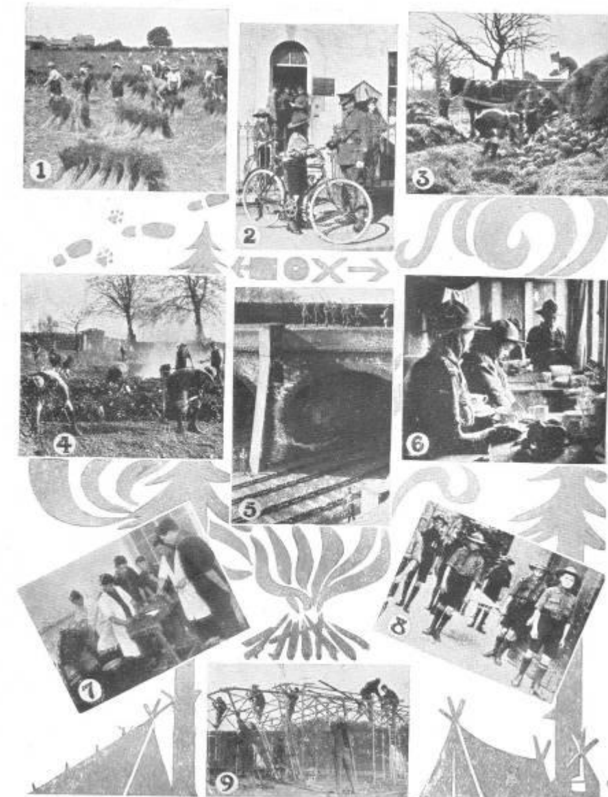
1. Flax Harvesting. 2. Despatch Riding. 3. Farm Work. 4. Allotment Work. 5. Guarding Railway Bridge. 6. Canteen Work. 7. Dairy Work. 8. First-Aid Work. 9. Building Huts for the War Office.