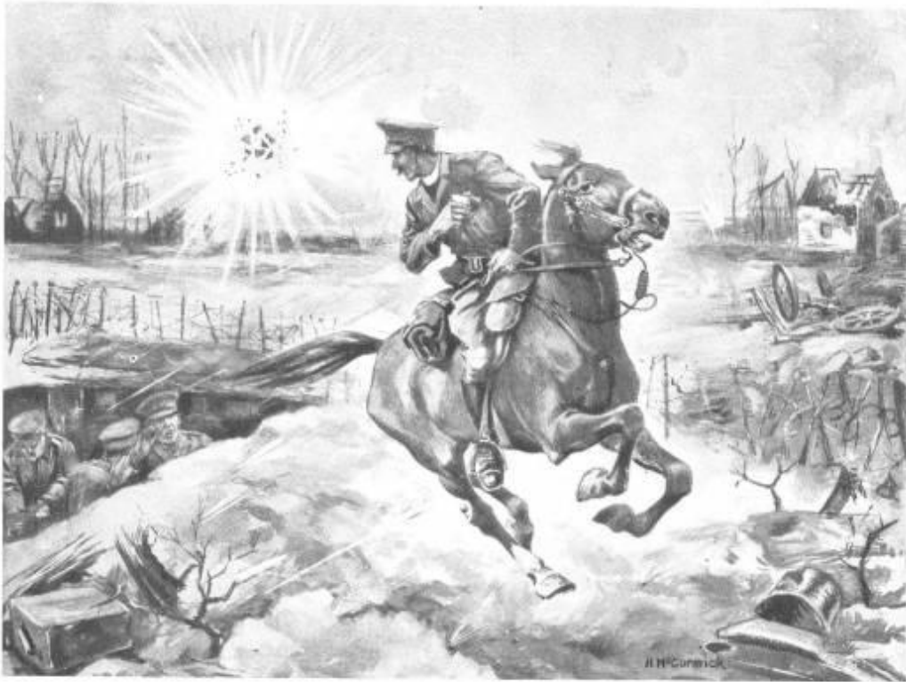
Putting spurs to his horse, the Chaplain galloped cut into the open.