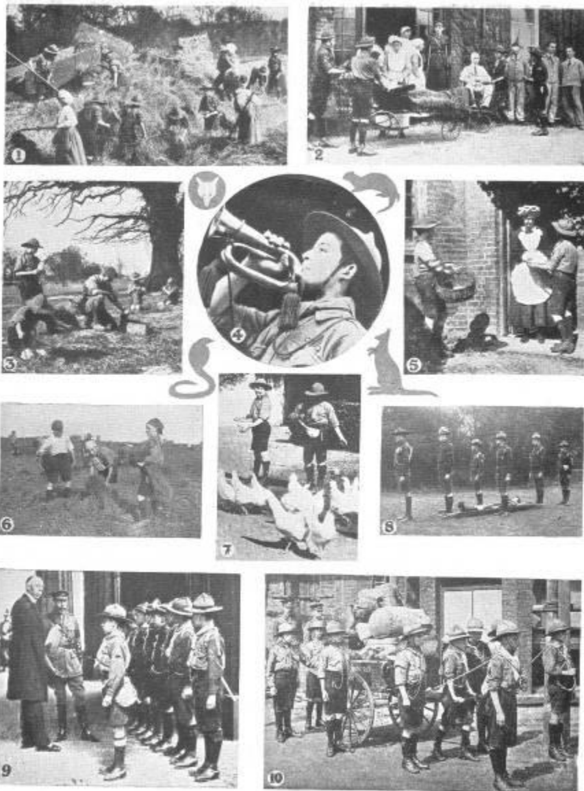
1. Haymaking. 2. Helping the Wounded. 3. Rabbit Trapping. 4. Sounding "All Clear." 5. Eggs for the Wounded. 6. Flax Harvesting. 7. Poultry Work. 8. Stretcher Work. 9. Orderly Duty for the King. 10. Waste Paper Collectors. WAR SERVICES OF THE BOY SCOUTS.