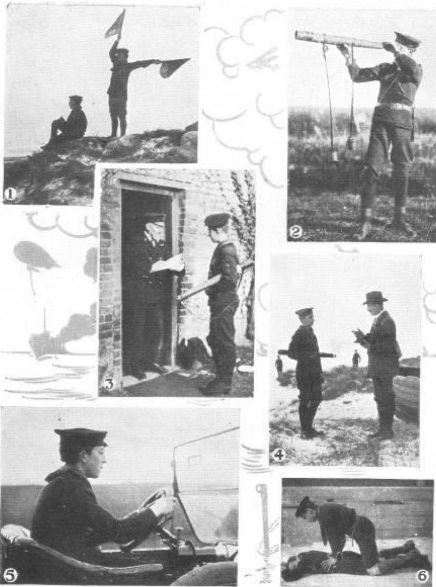
1. Signalling. 2. Look-out Duty. 3. Reporting to Station Officer. 4. Challenging a Photographer. 5. Chauffeur to the Coast-watching Officer. 6. Life Saving.