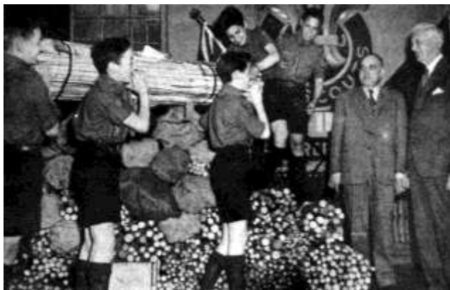
Good Turn to Brother Scouts

During World War II Scouts performed many kinds of national service for which the government thanked them. They collected vast quantities of needed waste paper, iron, aluminium, etc. In some communities Scouts took complete charge of salvage drives. When there was a serious shortage of medicine bottles for military hospitals they gathered hundreds of thou-