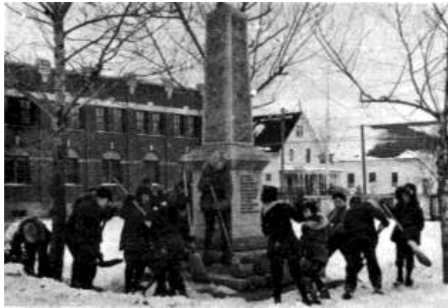
Community Good Turn

For many years Boy Scout Toyshops across Canada supplied thousands of Christmas gifts to the children of new settlers in the West and needy families elsewhere. At Easter certain Groups have collected quantities of eggs for children in orphanages. In addition to such special projects Scouts have acted as ushers at scores of conventions and public gatherings; have operated First Aid posts, information booths and Lost Children bureaus at fairs and exhibitions. Even more spectacular perhaps, are the hundreds of deeds of heroism and life saving by Boy Scouts recorded at Canadian Headquarters.