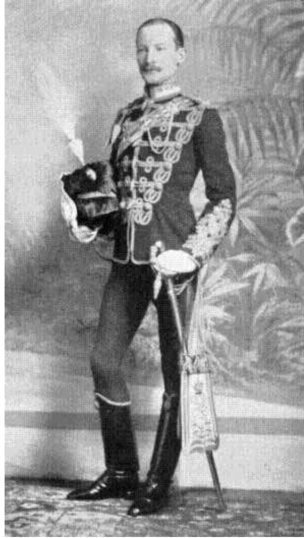
“VIRET IN ÆTERNUM”

am glad to add, sailors too. He was the life and soul of the place, indefatigable in getting up sports and theatricals for the men, and building a permanent club for their use, which effectually prevented the weaker men, or shall we say the more generous hearted? from spending too much money in public-houses. It was a sight to see the gymnasium, in which the theatricals were held, during one of Baden-Powell's performances. The vast floor of the building was crowded with soldiers packed as tightly as sardines, and the rafters running from wall to wall were all bestridden by sailors as happy and as comfortable there as the Governor and his party sitting in the front row in their splendid chairs from the palace. And when B.-P. appeared in the wings a shout such as might have brought down the walls of Jericho shook the great building, and soldier and sailor vied with each other to see who could keep that roar of welcome going the longest. And over and over again did Baden-Powell apply for leave to shirk some great social function in the palace because the hour of such entertainment clashed with the time he spent among Tommy and Jack in the gymnasium or the club.