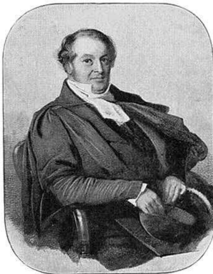
From a Painting by Hartmann. PROFESSOR BADEN POWELL.