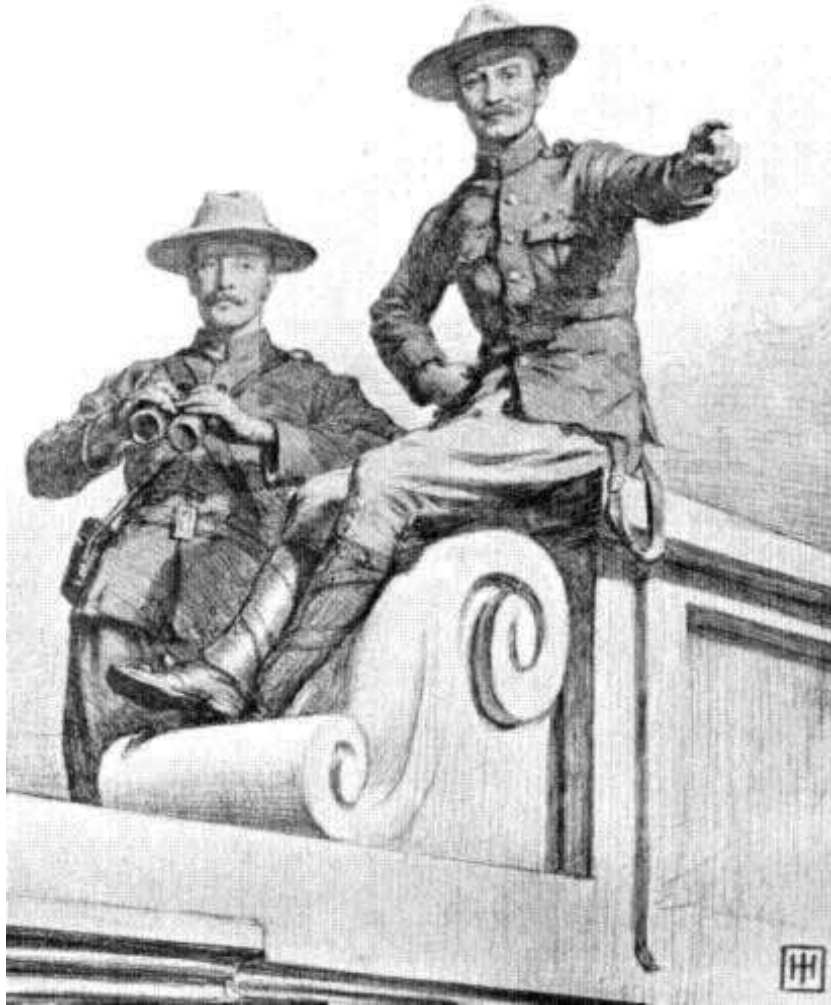
Goal-Keeper

pastimes has done wondrous things in the way of relieving the tension on the public mind, and keeping up the health of the population. It may shock the mind of some cranks to hear that we so spend our Sundays; but if such persons wish to test the worth and the wisdom of a rational Sabbath, transfer them here, and let them have a week of shell-fire. They will speedily become converts." During the Matabele campaign, it may be remarked, Baden-Powell always held divine service on Sunday, and even to those whose training makes them regard the playing of innocent games on Sunday an offence, this holiday of Sunday in Mafeking must surely be regarded as a holy-day, pleasing to the Father of men. The love of Baden-Powell for children, his intense eagerness to keep alive the flame of joy in their young hearts, and the spark of hope still burning in the hearts of their defenders, could not, we may be very certain, inspire any decision displeasing to high Heaven.