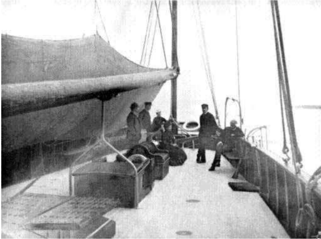
B.-P. REFLECTING ON THE AFTER-DECK OF THE PEARL

the governess discovered that she had walked farther than she intended and was in strange country. Ste was elated. But enquiry elicited the information that the party was not lost, and that they could return home by a shorter route; then was Baden-Powell miserable and cast down. He protested that he wanted the party to get lost so that he could find the way home for them.