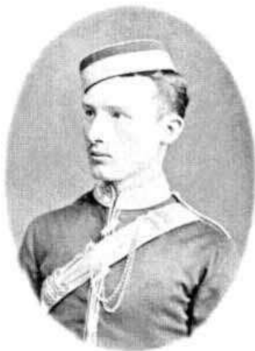
THE DASHING HUSSAR. (B.-P. AT 21.)

Concerning B.-P. as an actor, it is characteristic of the thoroughness with which he does everything that he always draws and redraws any character he may be playing until he is perfectly satisfied with the dress and make-up; some of these drawings have been captured by his brother-officers, and are greatly treasured.