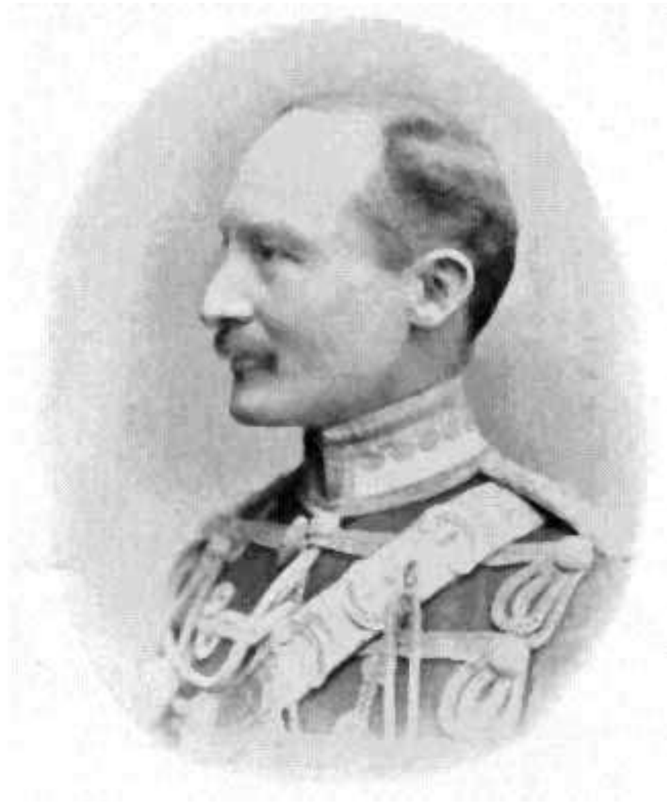
MAJOR-GENERAL R.S.S. BADEN-POWELL.