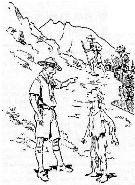
The Scoutmaster shows the boy the way to become a Scout and helps him on the Scouting trail.

So try to do your duty the right way on all occasions.