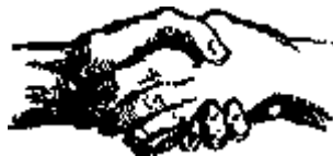
A Scout shakes hands with another Scout with the left hand, in the Scout Handshake.

Slaves or serfs were not allowed to carry weapons, and so had to slink past the freemen without making any sign.