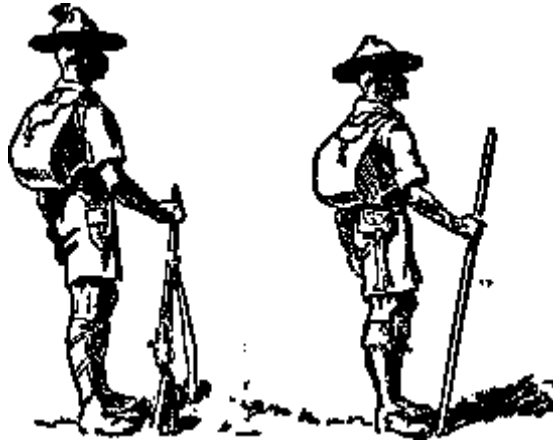
The Scout Uniform, used around the world, is very like the uniform worn by the men of the South African Constabulary.