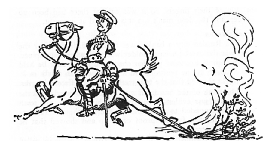
A great deal of dust does not always mean many people. Here is a ruse that was used to draw the attention of the enemy: Branches of trees were towed along a dusty road, to imitate moving cavalry.

jot down sketches of them in your notebook, so that you would know the footmarks again if you found them somewhere else, as the shepherd boy did in the story at the beginning of this book.