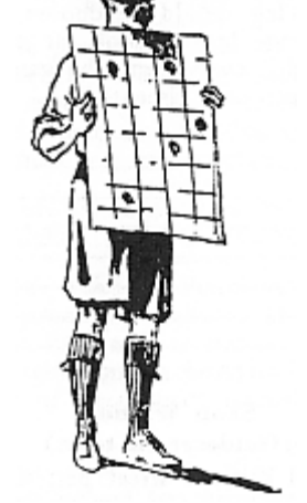
"Old Spotty-Face" is a good game for practising observation. It also helps to sharpen the eye sight.

The leader then takes a large sheet of cardboard, with the same number of squares ruled on it of about three inch sides. The leader has a number of black paper discs, half an inch in diameter, and pins ready, and sticks about half a dozen on to his card, dotted about where he likes. He holds up his card so that it can be seen by the