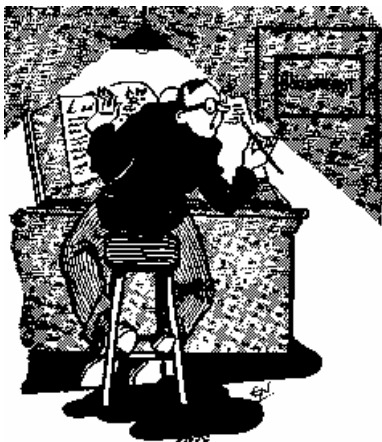
“The dullest part of the book”

The income for the year to 31st March, 1955, was roughly £95,000. The principal items were – “Bob-a-job” week £45,000, Scout shops’ profit £22,000, income from investments and rents £15,000, Government grant £5,600, and subscriptions and donations £3,500.