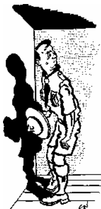
“Cannot hide itself in a corner”