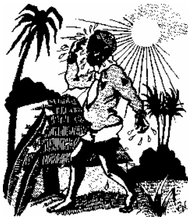
“Cub jerseys are not suitable for Fiji”