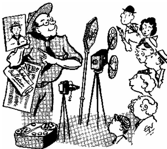
“Tries to keep the public interested in a variety of ways.”

The Publicity Department tries to keep the public interested in a variety of ways.