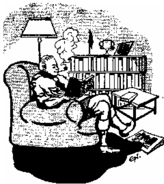
"Help from the written word"

As the Publicity Secretary says, "There is never a dull moment, and our days are crowded with interest."