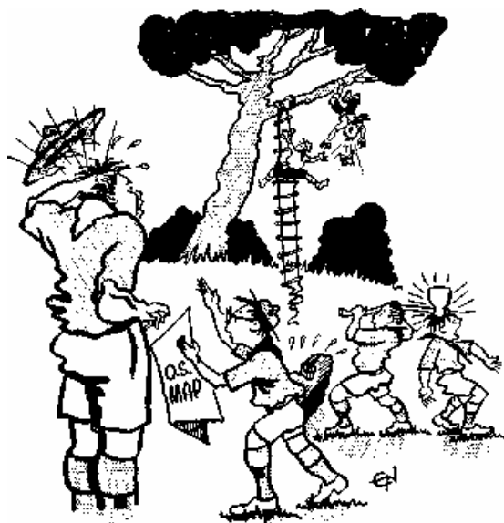
"The necessity for training of Scouters"

In this way, the system of Wood Badge training became world-wide, and Scouters from more than 90 different countries have attended training courses at Gilwell Park. Some of them are nominated by their countries to carry on this training in their own places, and receive authority from the International Bureau and the Camp Chief to do so. In this way, Scouting throughout the world has remained remarkably united. If you are interested in further details, you should read "The Gilwell Book" and the pamphlet "The Training of Scouters."