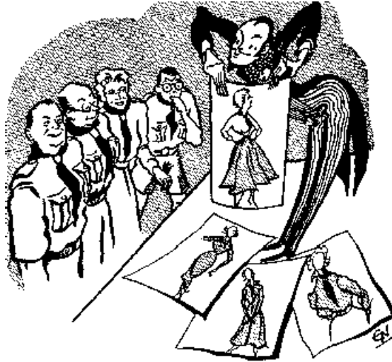
“The search for the perfect uniform for cub ladies.”

The Handicapped Scout Branch produces a variety of technical problems, relating to the special needs of Scouts who are crippled, epileptic, deaf, blind or mentally defective, and the Commissioner in charge consults many specialists on these problems. Alternative tests have to be kept up to date. A quarterly leaflet called “The Window” is provided for Scouters of these Groups.