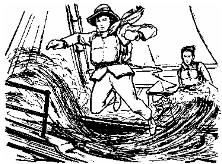
The leaf was a matter o/ split-second timing

'Splendid, young 'un, splendid,' made a youthful pair of shoulders go back squarely, and a chin lift in pride.