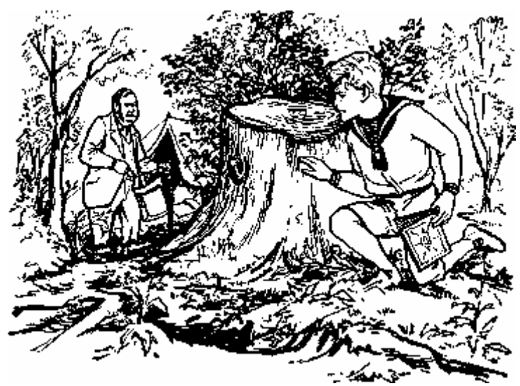
The man quite obviously thought he was alone

'Hi, what are you doing?' Then, as the man looked up, startled, Ste turned and running back into the shelter of the trees yelled: 'Uncle-Uncle, there's a man taking our things. Hurry!'