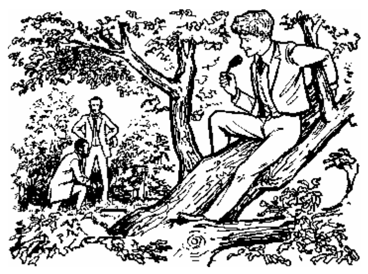
From his hide-out in the tree, B-P watched

From fifteen feet up B-P looked down on his little camp fire. Two men had found it. One had taken a risk by walking through the knee-high nettles, and was wishing he had gone the other way. The second master had gingerly brushed aside the clinging branches of blackberry as he made his way through to where the rabbit, looking very small and nicely brown now, hung in its separate parts over the glowing fire.