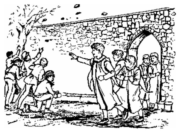
A volley of stones took the Smithfield boys in the flank

'For the benefit of the ill-informed,' B-P said, his eyes twinkling, 'it means "Those who are about to die salute those who are about to die. And that's us. You new chaps — mortis causa! You don't know that? Hrrmpy!'