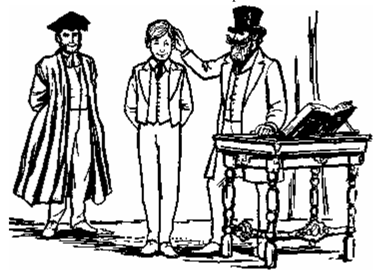
He patted the blushing boy on the head

'I have not had the pleasure of meeting you, sir,' the Doctor said, but before he could introduce himself the visitor leaned forward and in a whisper said: