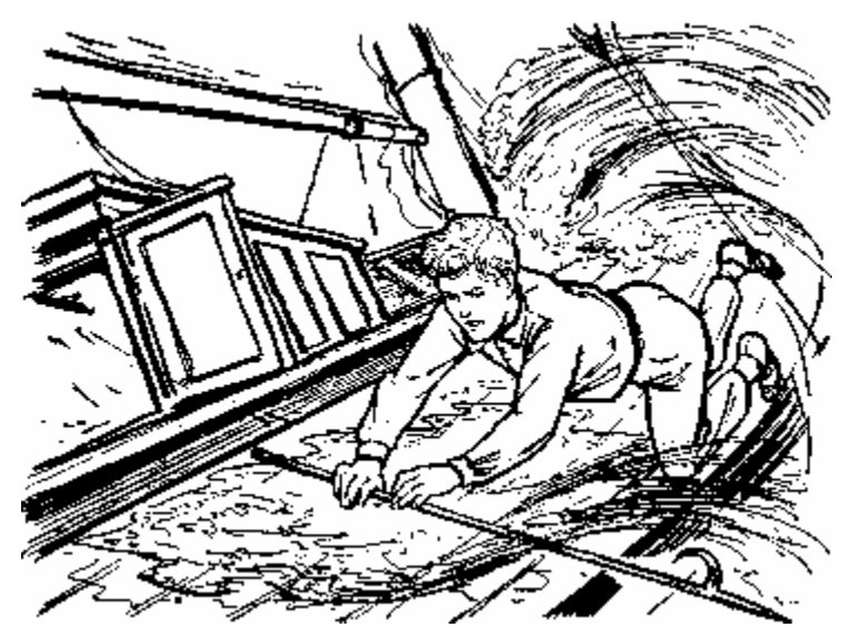
He flung himself down to grab the boathook